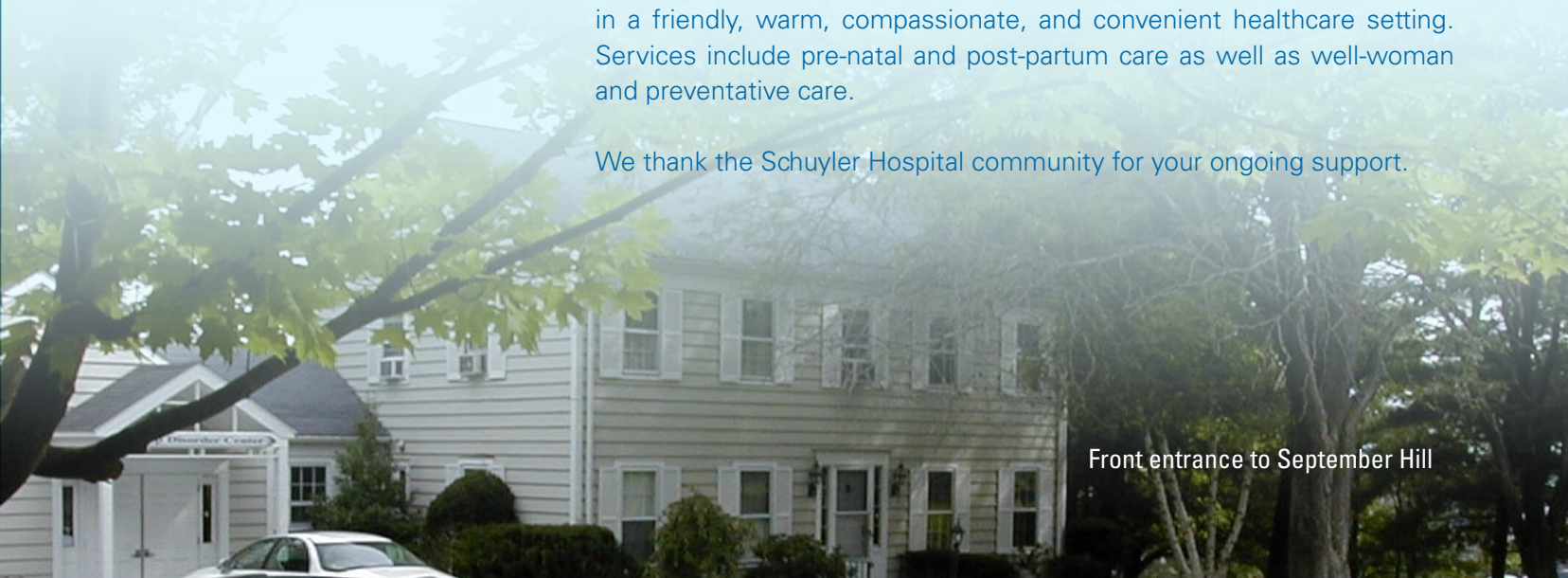
Front entrance to September Hill

We thank the Schuyler Hospital community for your ongoing support.