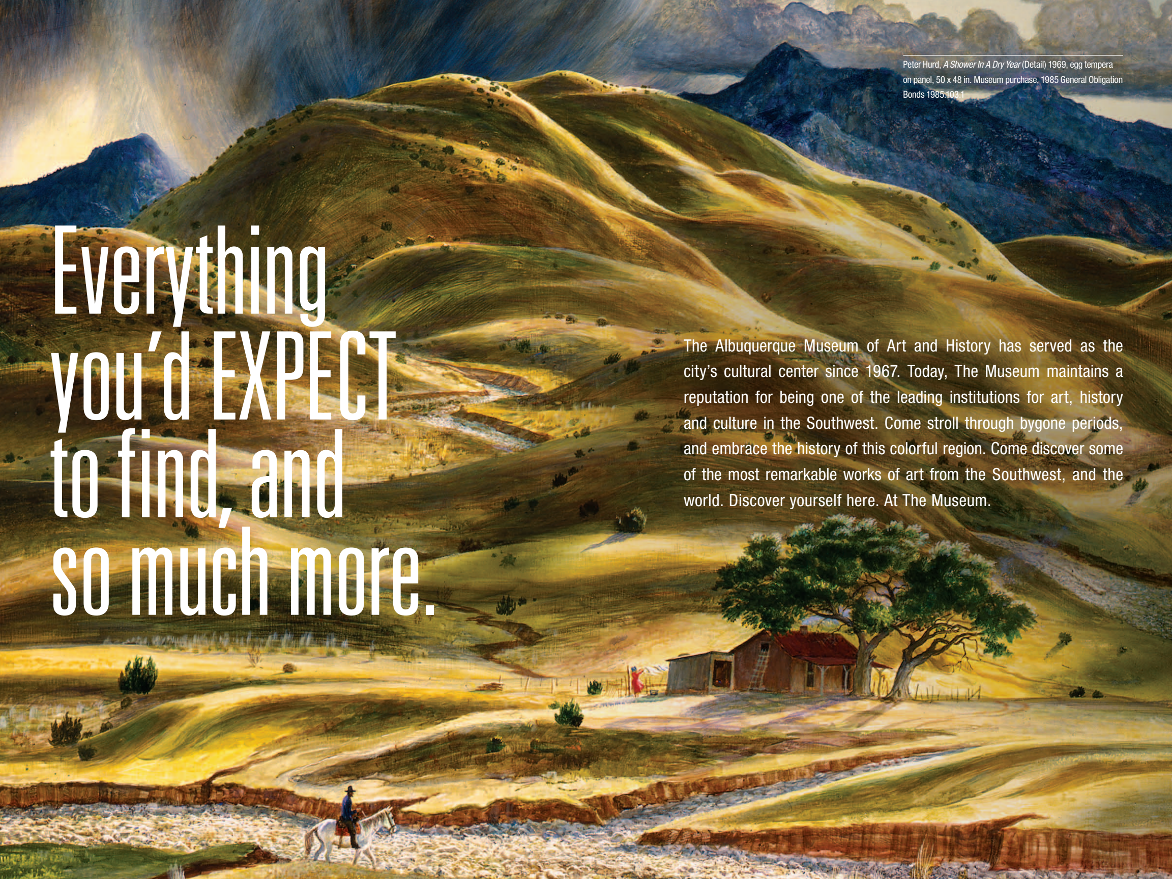
Peter Hurd, A Shower In A Dry Year (Detail) 1969, egg tempera on panel, 50 x 48 in. Museum purchase, 1985 General Obligation Bonds 1985.103.1

Everything you'd EXPECT to find, and so much more.